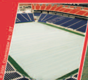
Covers for football and soccer fields are also readily available.