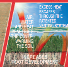
It works on the greenhouse principle, every time!