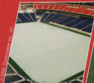
Covers for football and soccer fields are also readily available.

MASTERS IN THE ART OF SPORTS SURFACE COVERS