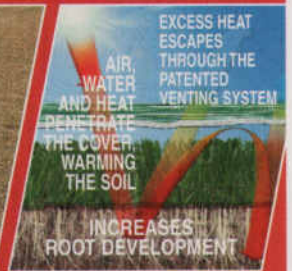
It works on the greenhouse principle, every time!