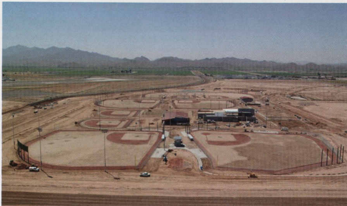
Latest look at Goodyear project.

generation owners of the underlying property; and San Diego-based JMI Sports LLC, received the green light to advance the design and construction of the Spring Training complex and surrounding private development. The City also authorized the issuance of up to $10 million in bonds for ballpark development and approved a special use agreement with the Indians for 14 games to be played each season through 2029.