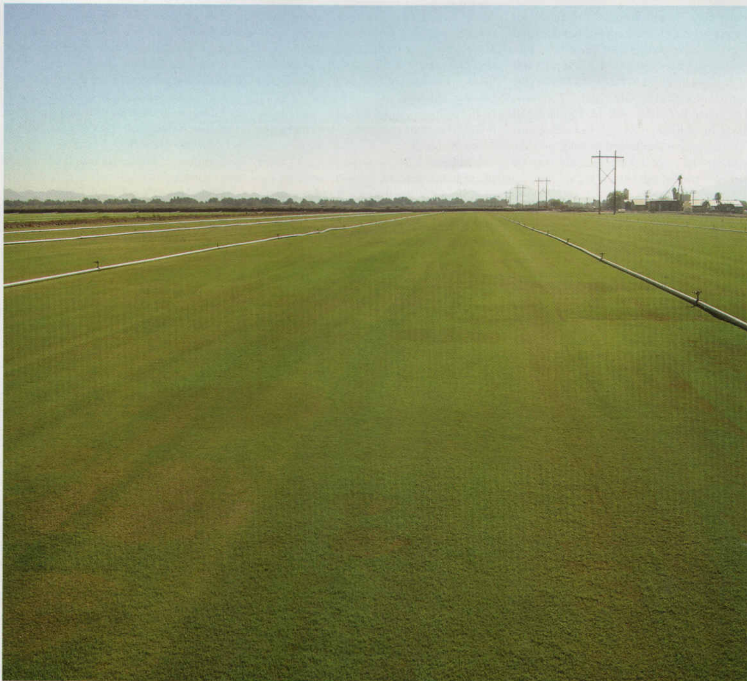
West Coast Turf Farms is supplying the Tifway 419.

ing will actually depend on how quickly the rest of the project is completed. The turf installer is typically the last contractor on the job, following the sand, irrigation, and warning track installation. "We're the caboose of a big train," Traficano laughs. "But I want to be done by July so they can make their August turnover date."