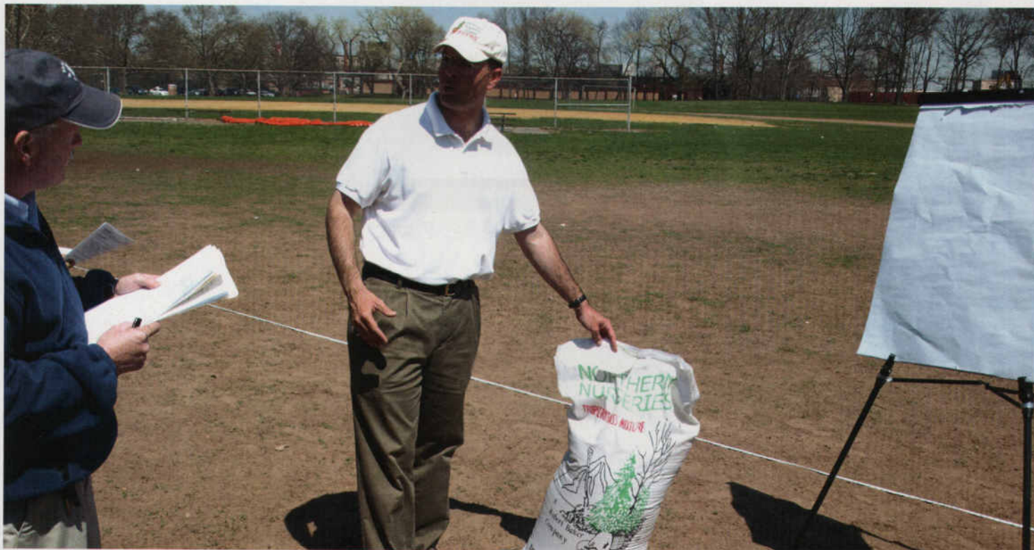
Instead of simply selecting a "Sports Turf Mixture" for an athletic field, examine the turfgrass species and individual varieties used to comprise commercial seed blends and mixes.

The 2006 NTEP tall fescue trial at Rutgers was subjected to wear and compaction (traffic) in fall 2007; Padre and Biltmore (components of Blend A) were among the most traffic tolerant (NTEP, 2008b). Also, Padre was among the most traffic tolerant in the 2001 NTEP tall fescue trial at Rutgers when evaluated in 2002-03. Padre, Biltmore, and Magellen were top performing