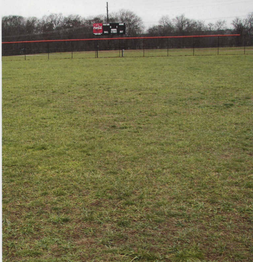
A high school baseball field in Southern New Jersey was a great candidate for renovation and establishment with tall fescue given the transition zone climate and minimal management inputs in the future.