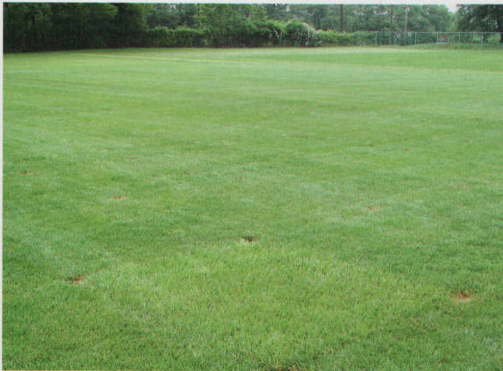
Significant improvements in the turfgrass quality of tall fescue have been achieved through breeding since the release of the cultivar Kentucky 31 (foreground) in 1940.

Tall fescue seeding rates are typically recommended at 4 to 8 lbs. seed/1000 sq. ft. The 8 lbs/1000 rate was recommended (Table 1) due to the crabgrass in this field. A denser turf will be more resistant to potential crabgrass encroachment in spring 2009, particularly if a premergence herbicide application for control of crabgrass is not made.