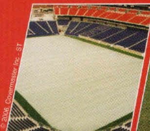
Covers for football and soccer fields are also readily available.