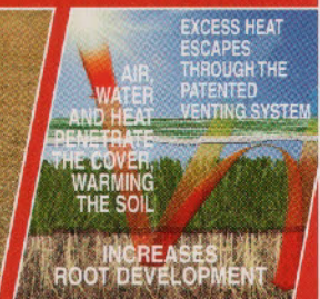
It works on the greenhouse principle, every time!