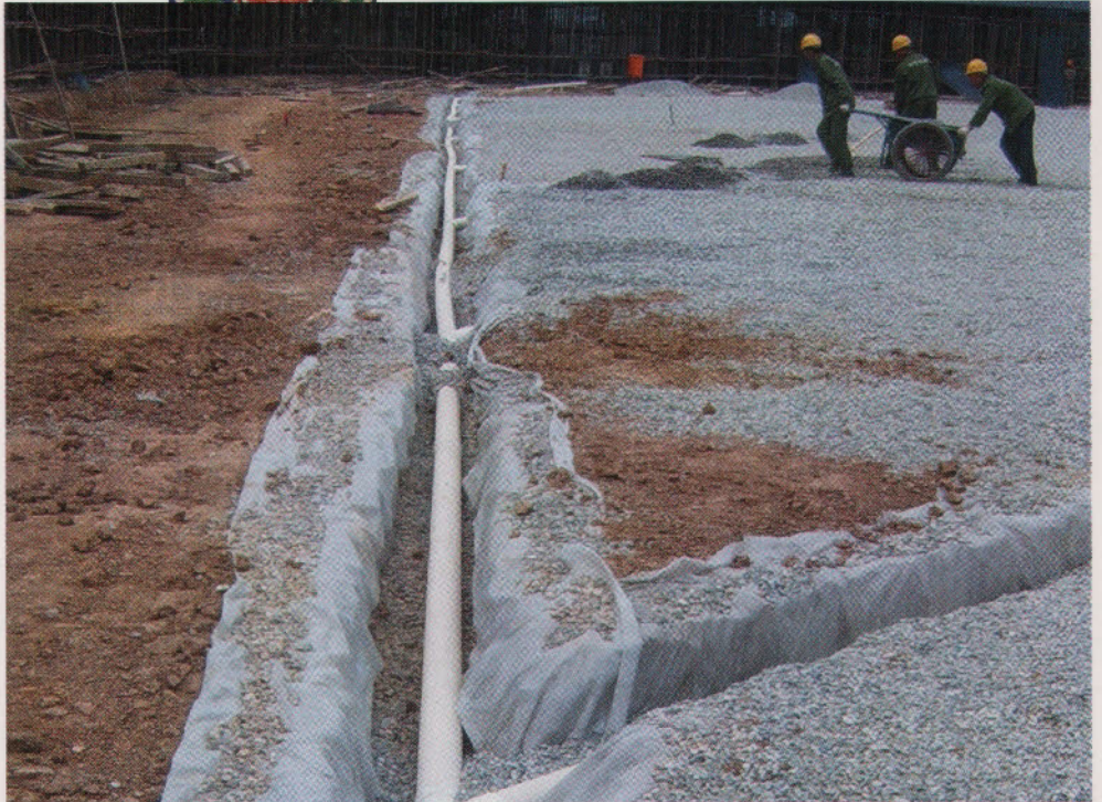
China is able to overcome equipment shortages through the sheer scale of its labor force.

As I've observed from my experiences with other sports turf design projects, team