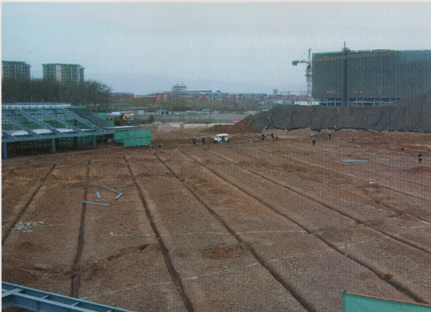
We will need to seed the fields rather than sod them, since China does not have the appropriate equipment for harvesting sod.