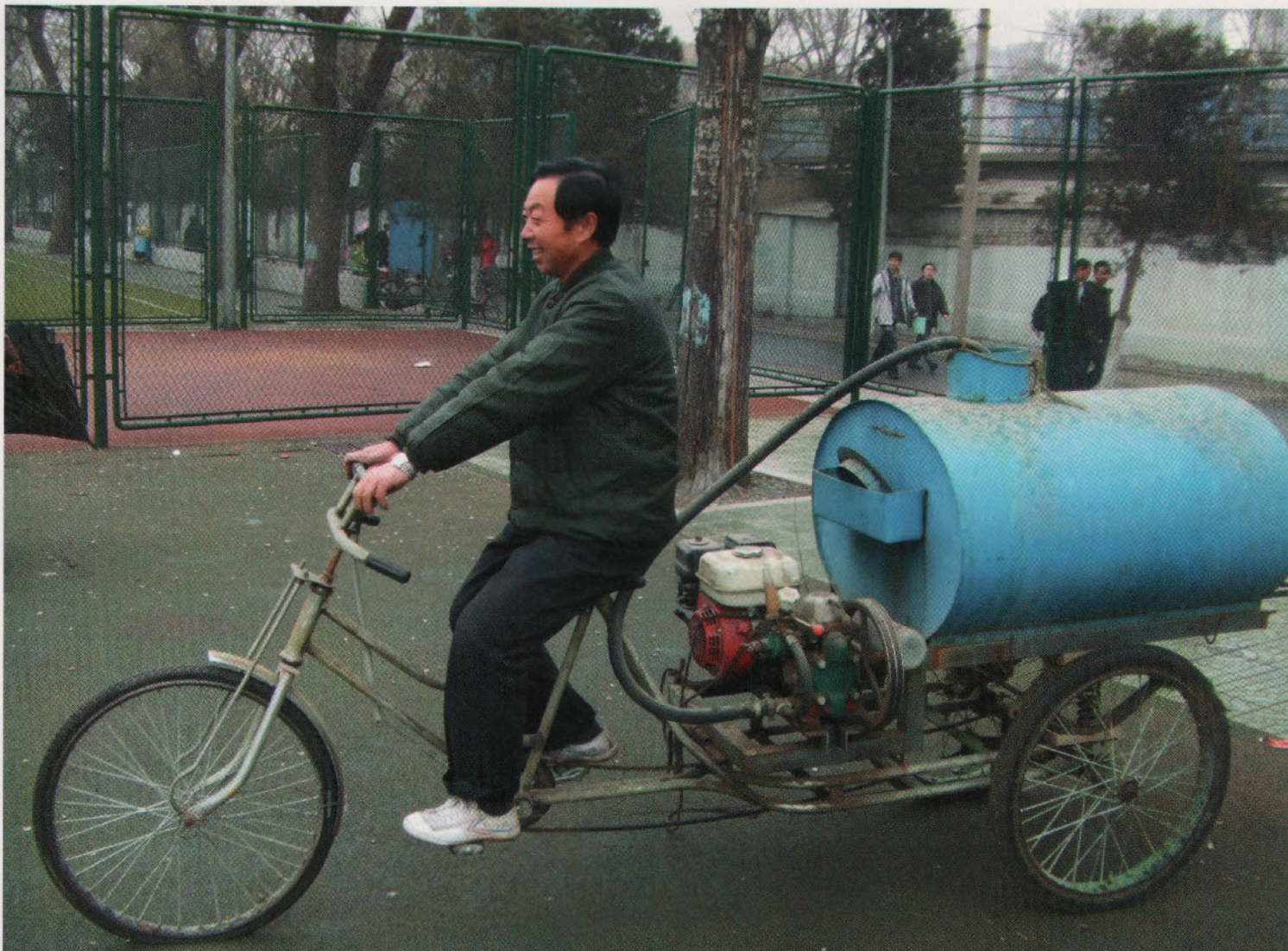
Beijing is a wonderful city that will undoubtedly host a vibrant and memorable Olympic Games in 2008.

collaboration is a critical element to success. Athletic turf construction projects involve a wide range of constituents beyond those directly performing the work. At the international Olympic level, constituents may include state and local policy-makers, competition committees, sponsors, and a host of others who are connected in some way. My work in Beijing and at previous Summer Games has made me realize that the Olympics influence people to become better international communicators by creating dialogue opportunities across cultural lines.