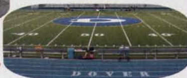
Dover High School Artificial Base →

Building Premium Athletic Fields Nationwide...For All Sports