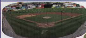
Frederick Keys Baseball