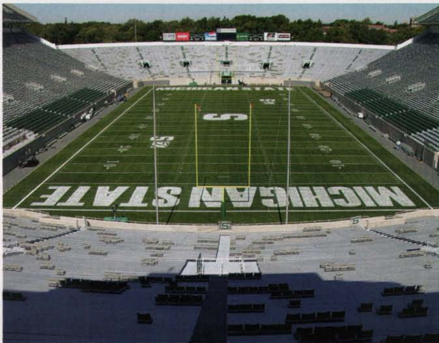
Spartan Stadium in East Lansing, MI

Top firms in the industry recognize the importance of recruitment and retention and seek to create supportive, family-friendly environments where individuals are recognized for their talents and challenged to grow beyond their comfort zone. Many times top firms will also provide