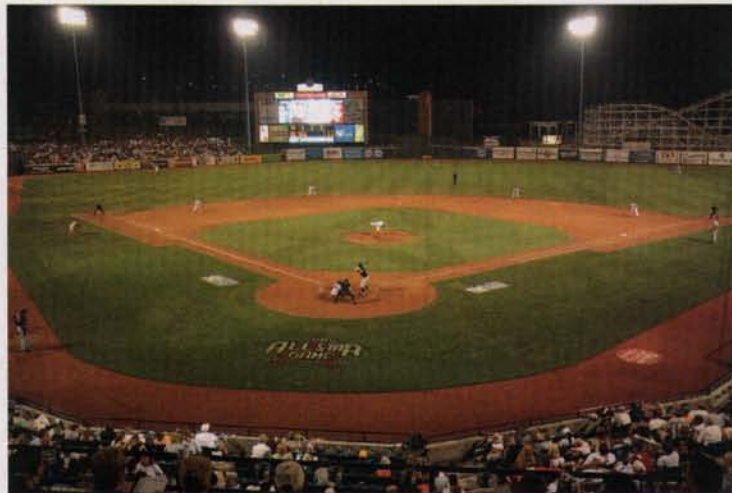
Blair County Ballpark, Altoona, PA

Once you have established your timeline, requirements, and list of competitive differentiators you need at each step along your career, begin