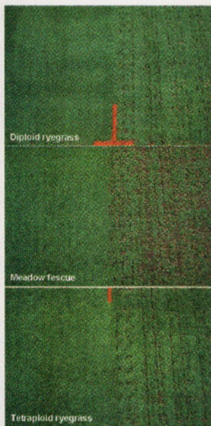
Photo 3: Traffic tolerance of the tetraploid ryegrass appears to be very similar to diploid ryegrasses.