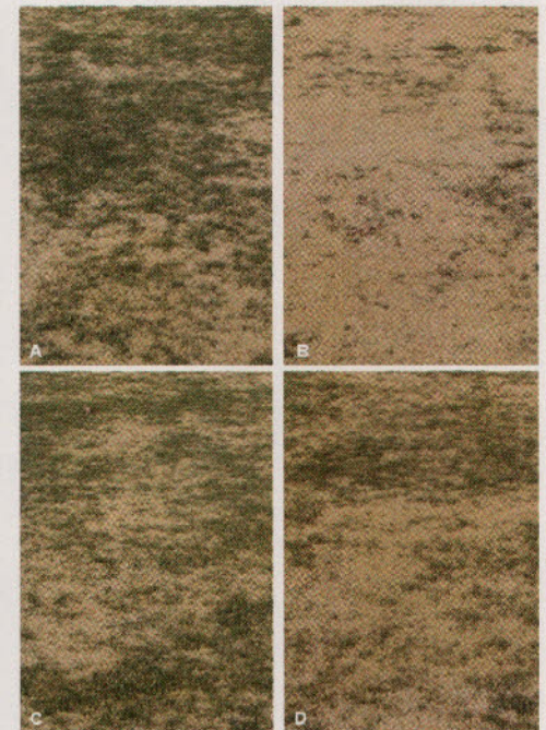
Photo 2: The tetraploid perennial ryegrass had the lowest survival of all species tested.