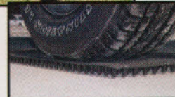
Hydraway 2000 HDPE Core Compressive Strengths Meet or Exceed 9200 PSF