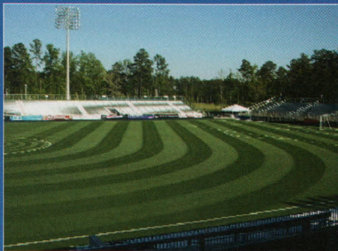
The overall experience for players and spectators is of the highest importance.

SportsTurf: What type of turf is featured at SAS Soccer Park? Drainage system?