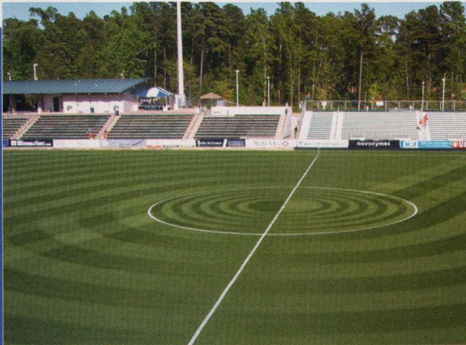
The newly formed USL Division One Carolina Railhawks play all of their home games at SAS.

very different from last year's schedule.