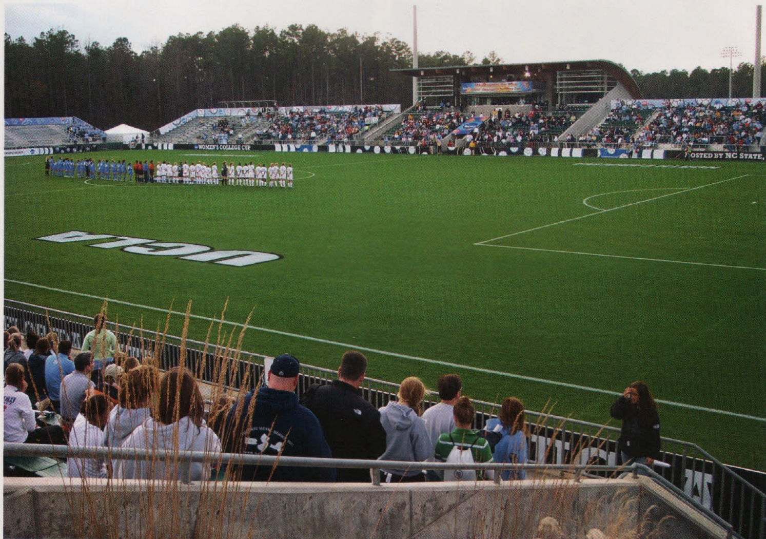
Above: SAS Soccer Park was home to the 2006 Women's College Cup, the NCAA women's soccer championship.