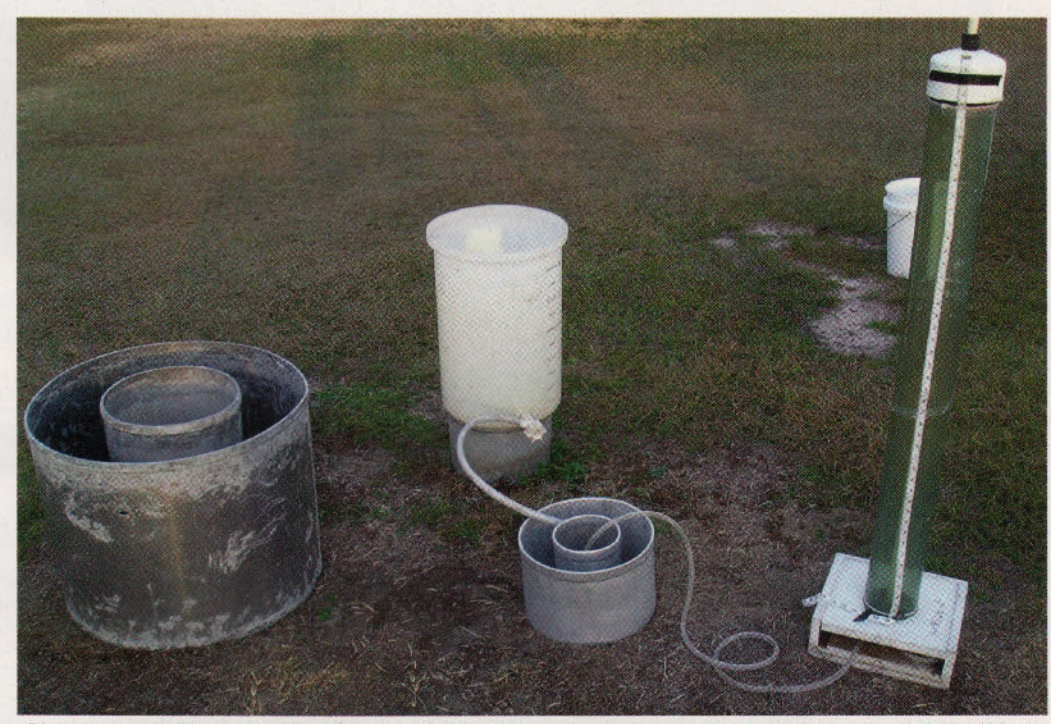
Photograph of 12-inch diameter (inner) and 24 inch diameter (outer) double ring infiltrometer (left/A); 6-inch diameter (inner) and 12 inch diameter (outer) double ring infiltrometer (center/B), and Marlotte siphon developed to maintain a constand inner head in the infiltration rings (right/C).

The size of the cylinder is one source of error. A 6-inch diameter ring produces measurement errors of approximately