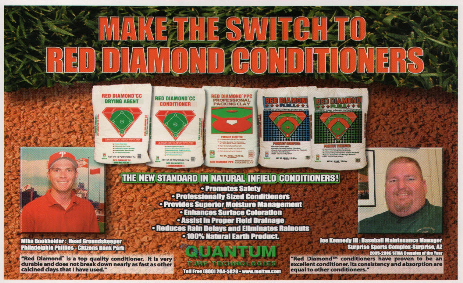
Fill in 124 on reader service form or visit http://oners.hotims.com/9138-124

An area at the Irrigation Park on the University of Florida campus in Gainesville was used to conduct the double-ring infiltrometer tests. The