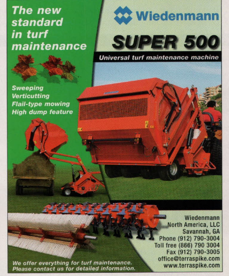
Fill in 135 on reader service form or visit http://oners.hotims.com/9133-135

Cheryl Naughton cnaughton@ m2media360.com 770/995-4964 Fax: 770/995-4983