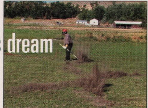
Some farmers and growers experience a 95-98% kill rate the first pass through, cover four times as much ground as they did with other methods and are at least 50% more efficient labor-wise using the Rodenator Pro.