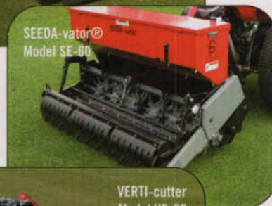
SEEDA-vator® Model SE-60