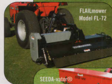
FLAILmower Model FL-72