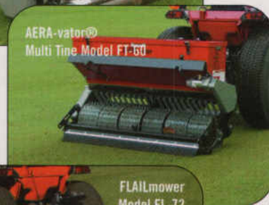
AERA-vator® Multi Tine Model FT-60