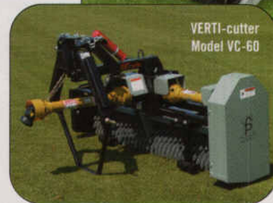
VERTI-cutter Model VC-60

www.1stproducts.com FIRST PRODUCTS, INC.