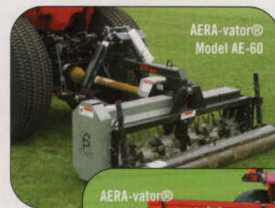
AERA-vator® Model AE-60

Patented swing hitch allows units to turn without tearing the turf.