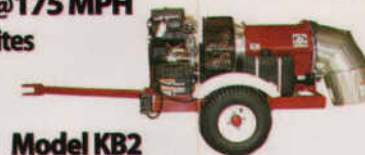
Model KB2 (trailer, skid or utility vehicle)