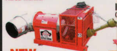
Hurricane PTO (3-Point hitch mount)

NEW BT-1000 TerraTopper (Pull behind top dresser)