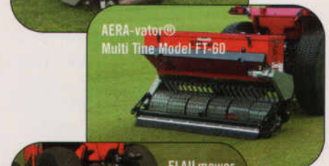
AERA-vator® Multi Tine Model FT-60