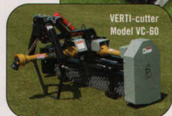
VERTI-cutter Model VC-60

www.1stproducts.com FIRST PRODUCTS, INC.