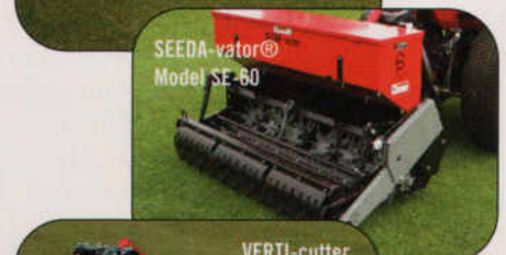
SEEDA-vator® Model SE-60