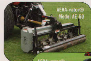
AERA-vator® Model AE-60

Patented swing hitch allows units to turn without tearing the turf.