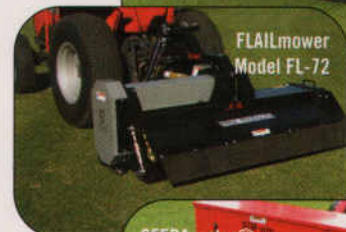
FLAILmower Model FL-72