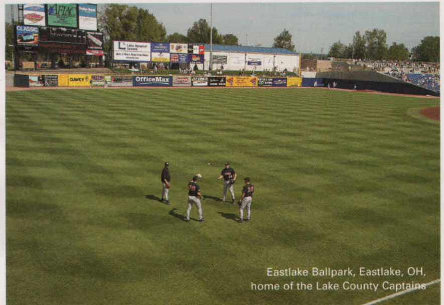
Eastlake Ballpark, Eastlake, OH, home of the Lake County Captains

That partnership grew from a desire to open educational and informational