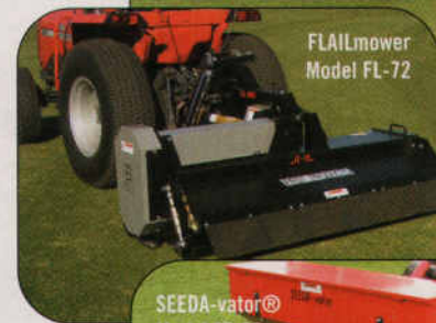
FLAILmower Model FL-72