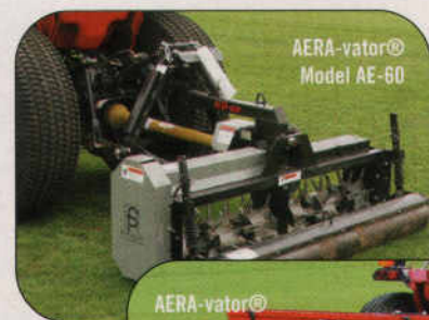
AERA-vator® Model AE-60