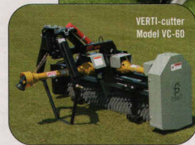
VERTI-cutter Model VC-60

www.1stproducts.com FIRST PRODUCTS, INC.