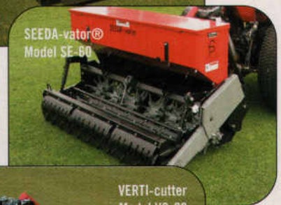
SEEDA-vator® Model SE-60