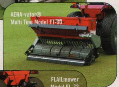
AERA-vator® Multi Tine Model FT-60