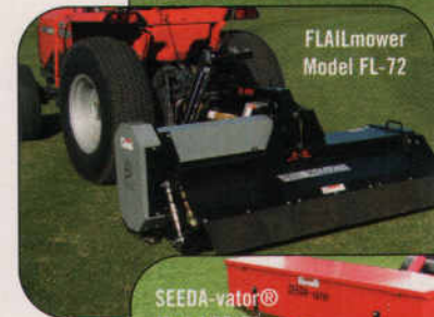
FLAIL-mower Model FL-72