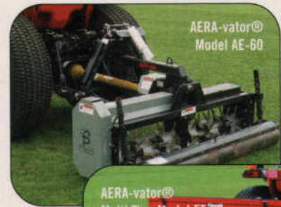
AERA-vator® Multi Tine Model FT-60

Patented swing hitch allows units to turn without tearing the turf.