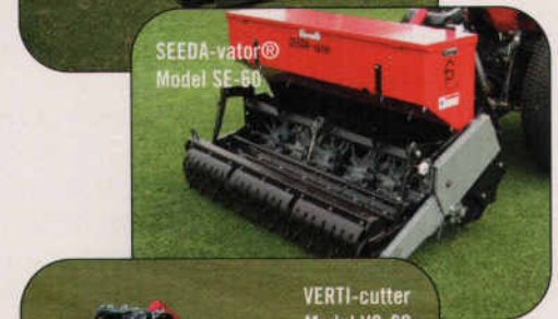
SEEDA-vator® Model SE-60