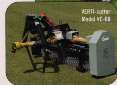
VERTI-cutter Model VC-60

www.1stproducts.com FIRST PRODUCTS, INC.