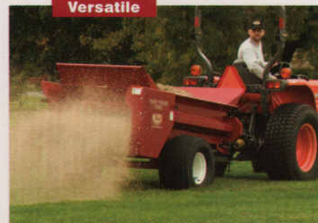
Both Turf Tiger Cub models can spread wet or dry, coarse or fine materials.