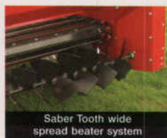
Saber Tooth wide spread beater system

The revolutionary Millcreek Saber Tooth™ spreading system makes all other topdressers obsolete. Millcreek's new, low-priced Turf Tiger™ Cub models, at under $9K , bring the world's best topdressers within reach of any school or park budget.