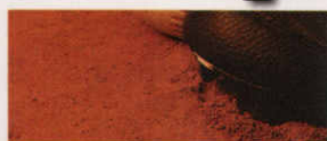
Infield Custom Blends