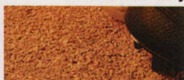
Calcined Clay (Turf)