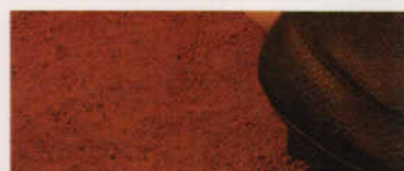
Mound Clay Fortifier