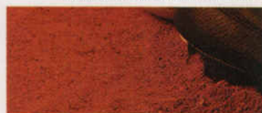
Diamond Clay Conditioner