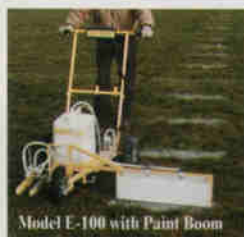
Model E-100 with Paint Boom