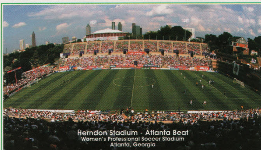
Herndon Stadium - Atlanta Beat Women's Professional Soccer Stadium Atlanta, Georgia

Circle 174 on card or www.oners.ims.ca/2083-174