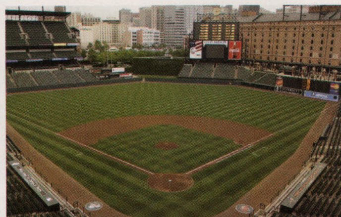
Camden Yards • Baltimore, MD Contains a blend of Turf-Seed® Kentucky Bluegrasses