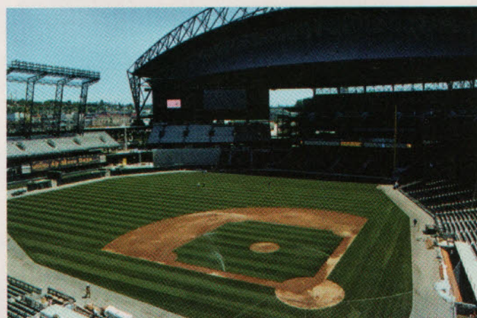
Safeco Field • Seattle, WA Contains a blend of Turf-Seed® Kentucky Bluegrasses