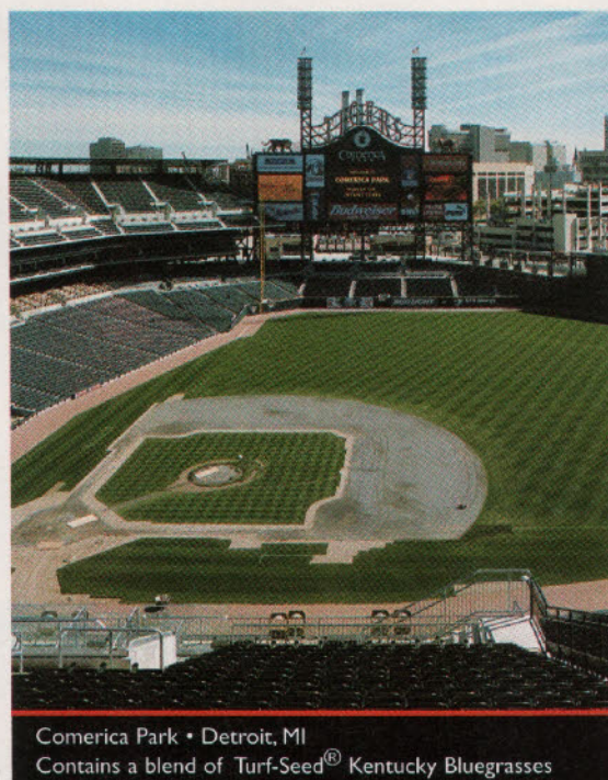
Comerica Park • Detroit, MI Contains a blend of Turf-Seed® Kentucky Bluegrasses

Low growing, less fertilizer, drought and disease resistant