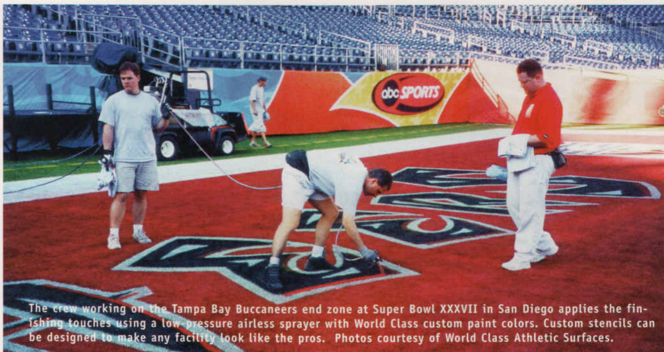
The crew working on the Tampa Bay Buccaneers end zone at Super Bowl XXXVII in San Diego applies the finishing touches using a low-pressure airless sprayer with World Class custom paint colors. Custom stencils can be designed to make any facility look like the pros.

A lthough many field managers use paint strictly for delineating the required boundaries and markers of the playing surface, field paints truly shine when colors are used for elaborate field art, such as football field end zones, midfield designs and other detailed logos. The following photo essay provides a glimpse of the possibilities that field paints offer.