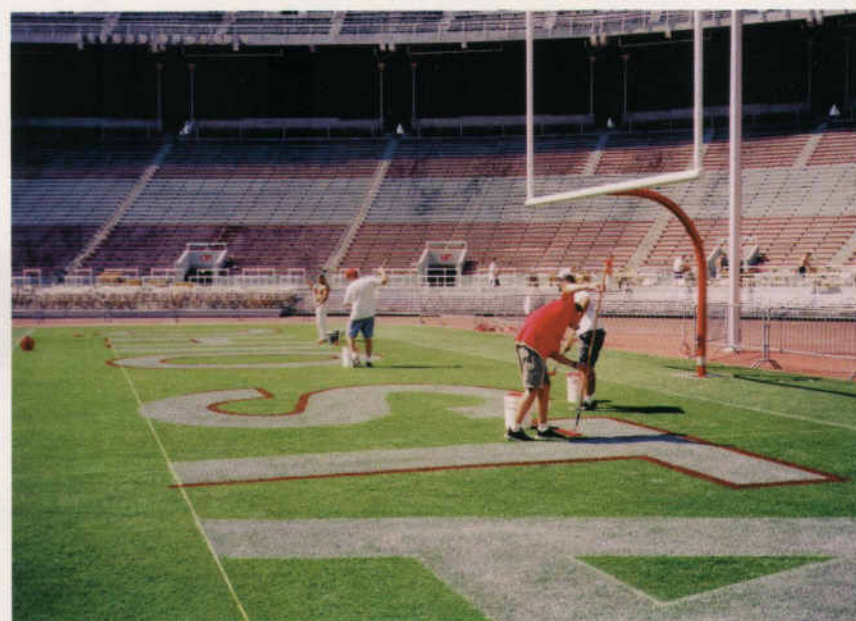
The crew paints the end zones mid-season, being careful to keep straight lines.