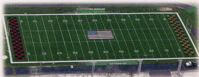
Mineral Water Bowl, Dec. 2002, NCAA Division II, Excelsior Springs, MO. ZAP field marking paint by Zeke's Paint, Independence, MO.

Circle 111 on card or www.oners.ims.ca/2079-111