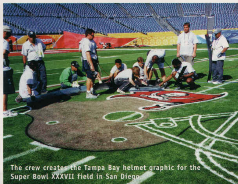
The crew creates the Tampa Bay helmet graphic for the Super Bowl XXXVII field in San Diego.

Circle 107 on card or www.oners.ims.ca/2079-107