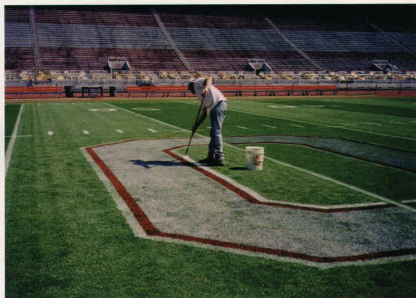
The crew at Ohio Stadium paints the second coat of the white border around Block O with a 4-inch roller using Pro-Stripe Super White.

"We have a lot of student help, so the rollers help the job to go really fast," Gimble added.