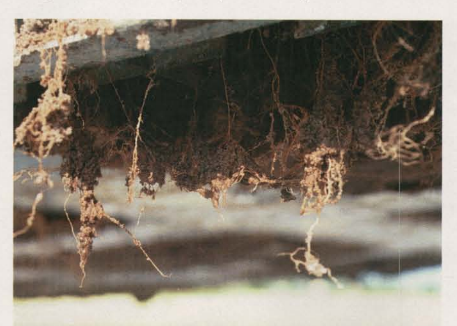
Eight weeks after being planted, the TifSport pokes through the rootzone in a module.

Although the zoysias had the best shade tolerance, Strantz felt it was important to look at the "real world" versus the "research world." "One of the grad students at the presentation was kind of bragging that they hadn't cut the zoysia in about 3 weeks. But the fact is, for what we're doing here, that's not necessarily a good thing. I want to grow some grass. I want to be able to grow-out paint, and the logo areas, and numbers and