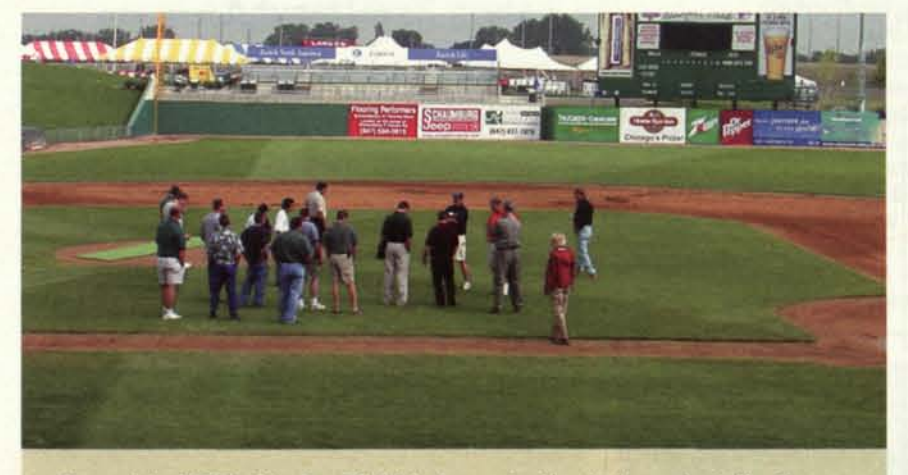
Opened in 1999, Alexian Field is home to the independent Northern League Schaumburg Flyers.

The tour returned to Alexian Field in the western suburbs to view batting practice and pre-game warm-ups, enjoy a picnic dinner, and then watch the Flyers game.