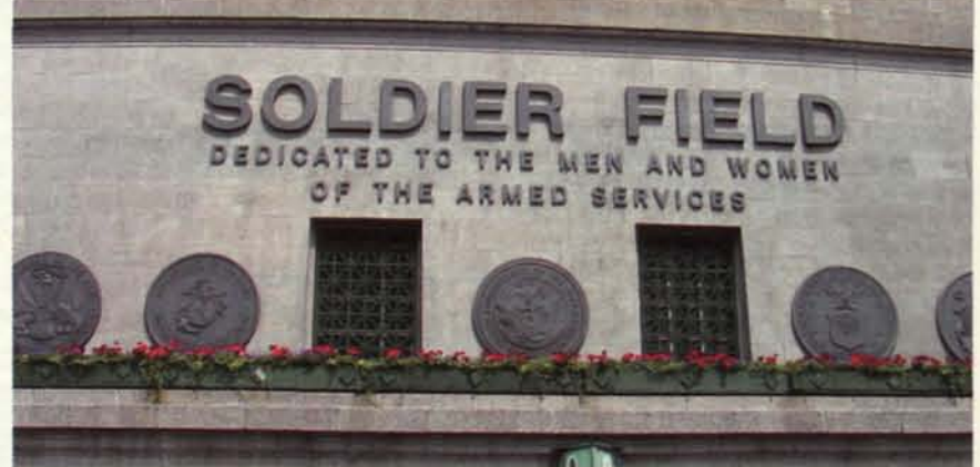
Venerable Soldier Field is due to undergo a renovation next year; selling its naming rights is causing controversy already, since the field is a memorial to the country's war dead.