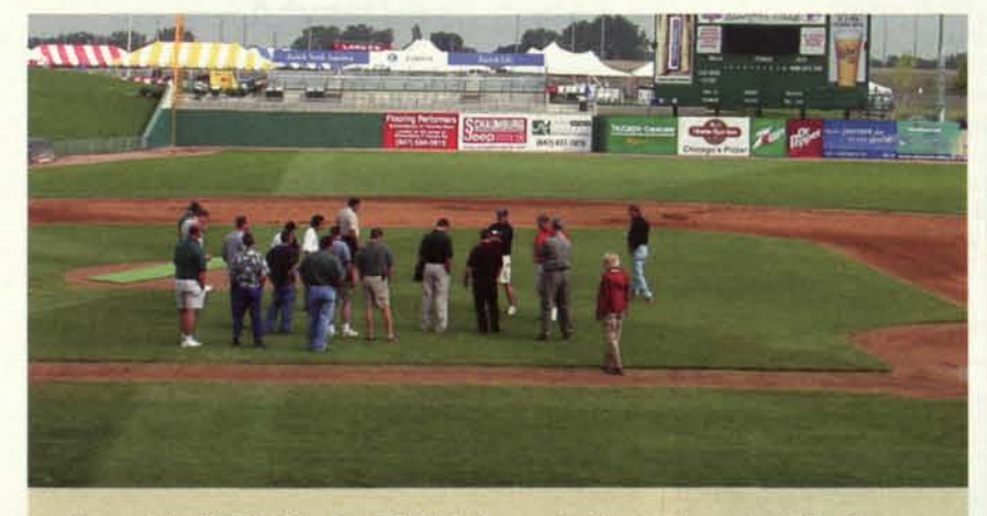
Opened in 1999, Alexian Field is home to the independent Northern League Schaumburg Flyers.

The tour returned to Alexian Field in the western suburbs to view batting practice and pre-game warm-ups, enjoy a picnic dinner, and then watch the Flyers game.