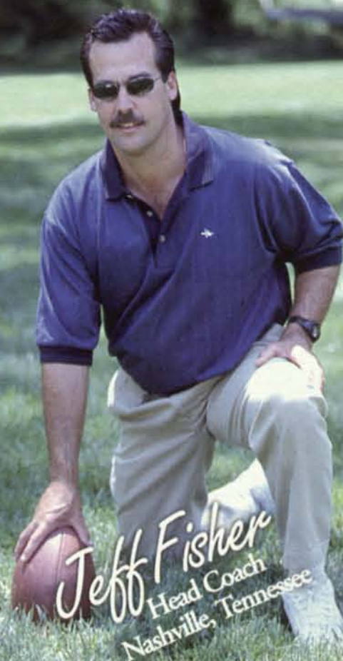
Jeff Fisher Head Coach Nashville, Tennessee

My professional football team was undefeated on grass from Turfgrass America