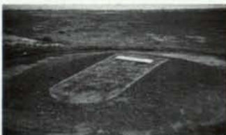
Excellent for High School and Recreational Use!

Legal in High School, Babe Ruth, Pony and Little League Baseball