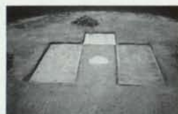
Pads shown ready to be covered over for game use.