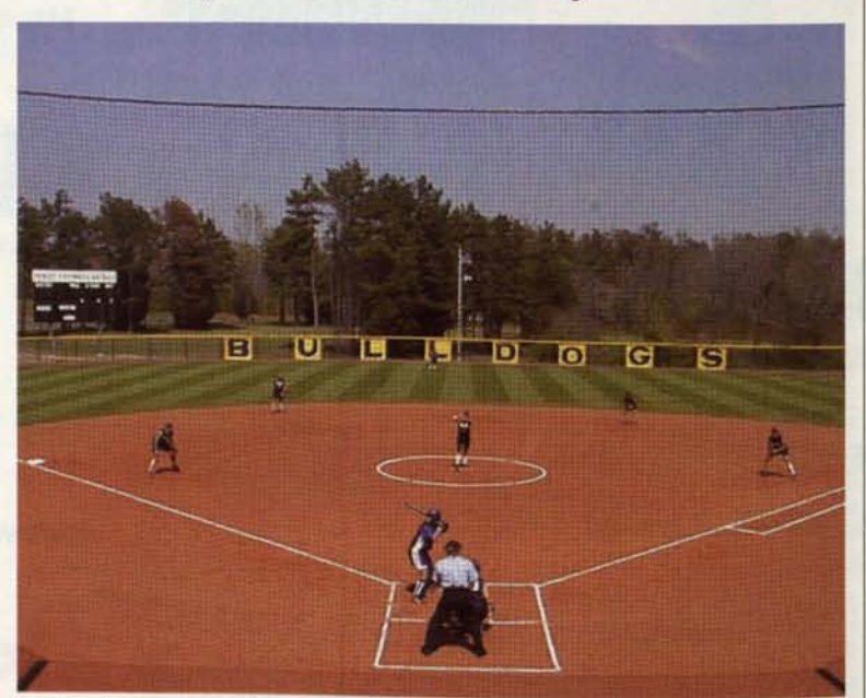
Circle 142 on Inquiry Card

MAKE THE RIGHT CALL... (704) 753-1707 www.cgcfields.com