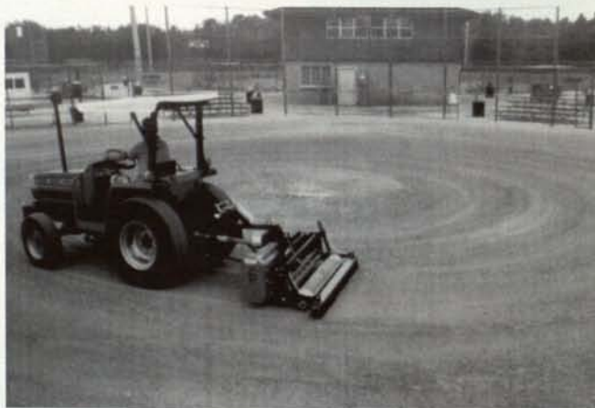
Scarify, Rake, Roll and Brush Infield