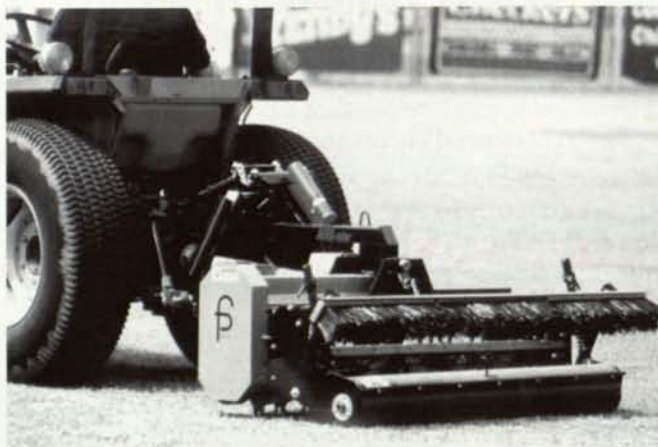
Aerate or overseed turf

The multi-purpose tool versatile enough for sports fields