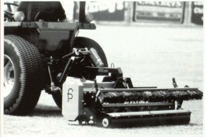
Infield Conditioner Scarify, Rake, Rol and Brush Infield