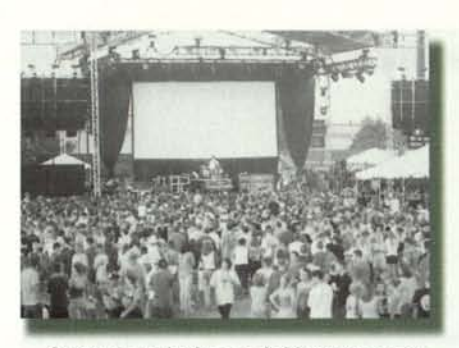
Concerts and other on-field events cause considerable damage to the turf.

women's football team, soccer and major national concerts. We host over 200 individual athletic contests during the season, in addition to the concerts and other special events. The short season encompassing three sports leads to a maintenance challenge."