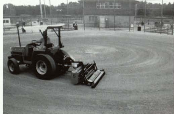
Outfield Aerator/Overseeder All with the same machine

First Products Inc Email: sales@1stproducts.com