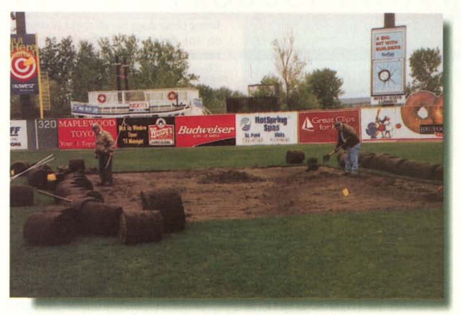
Crew members resod a section of the outfield

filled with softball games, dog shows, car shows, boxing matches, fantasy camps, company parties and even the filming of commercials. Two national