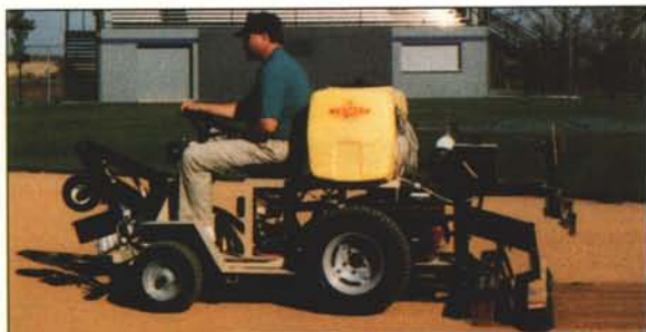
Kromer U-utility Athletic Field Maintenance Machine (AFMM™)

One machine does it all - lining - grooming - spraying - line cutting - ridge removal, etc.