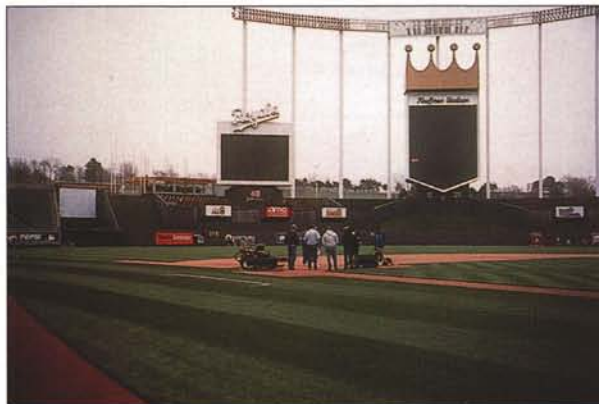
Each Station located around the ballpark had a designated topic and leader to stimulate discussion among the groups.