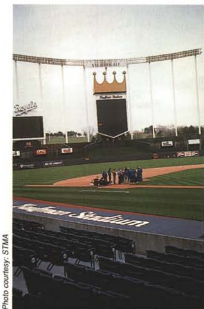
Attendees gather at the kickoff meeting of the forming MO-KAN Chapter of the STMA at Kauffman Stadium, Kansas City, Mo.