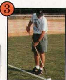
Four in Roller with Primo added to paint.