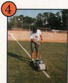
Canned aerosol paint with easy push applicator.