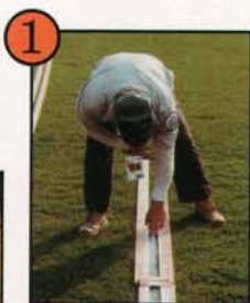
Two-inch form board.

A: YES, whichever way works for you! Here are four examples.