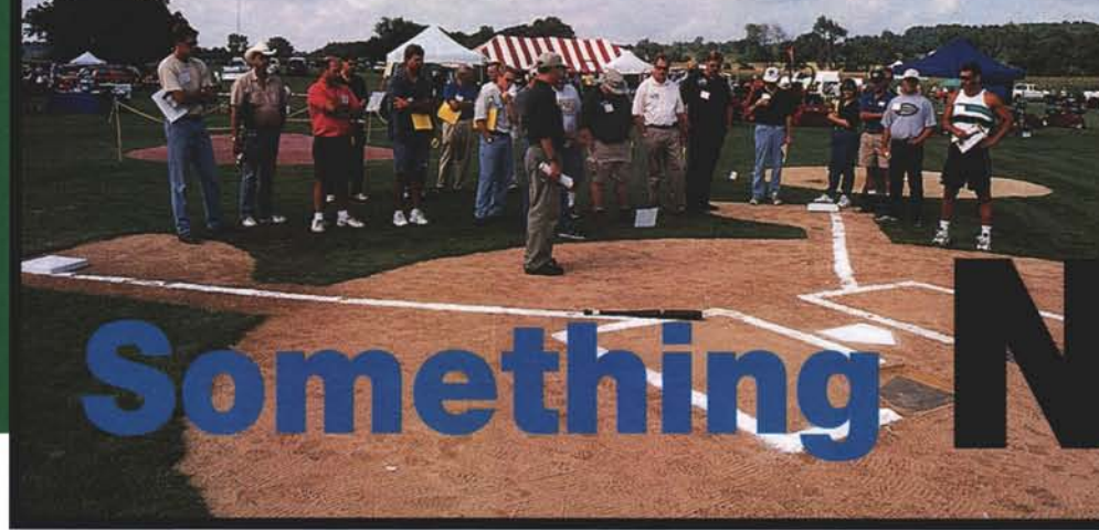
Wisconsin Turfgrass Field Day attendees inspect home plate and pitcher's mound demonstration plots at O. J. Noer Turfgrass Research & Education Facility.

ugust 4, the Minnesota Sports Turf Managers Association held its fifth annual Workshop on Wheels. The day was filled with education, idea exchanges, and lots of fun. Highlights of the tour included the following: