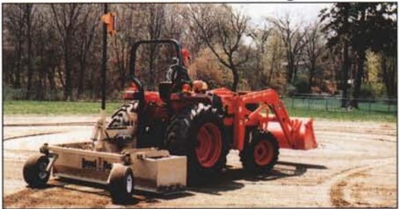
Level Best Grading System