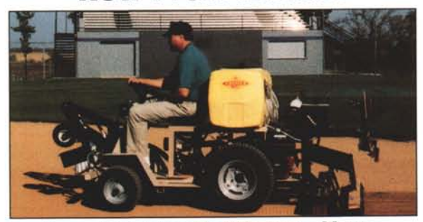
Kromer U-tility Athletic Field Maintenance Machine (AFMM<sup>™</sup>)

13hp engine for more power. Heavy duty hydrostatic transaxle. High back - comfortable - adjustable seat.