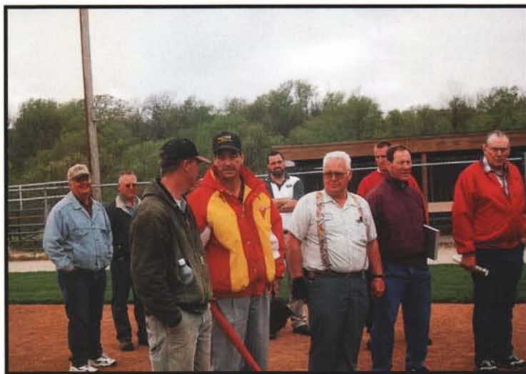
Unseasonably cold and rainy weather couldn't keep attendees inside at an ISTMA Workshop at Saint Albert High School in Council Bluffs.