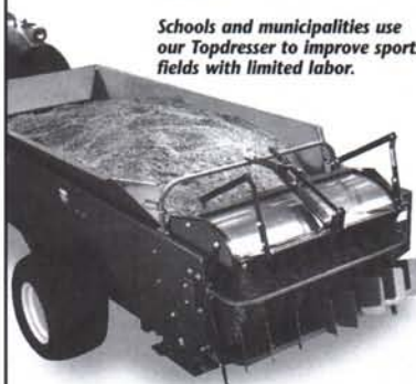
Schools and municipalities use our Topdresser to improve sports fields with limited labor.