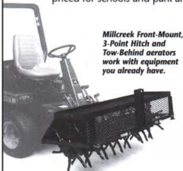
Millcreek Front-Mount, 3-Point Hitch and Tow-Behind aerators work with equipment you already have.

Give your grounds crews the right tools for basic sports turf maintenance without spending a fortune. Millcreek turf equipment works great and is priced for schools and park and rec dept's with limited budgets.