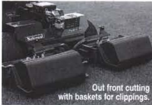
Out front cutting with baskets for clippings.

For information, contact John Mascaro: (954) 341-3115.