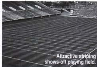
Attractive striping shows-off playing field.