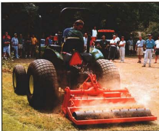
Equipment demonstration during the field day.