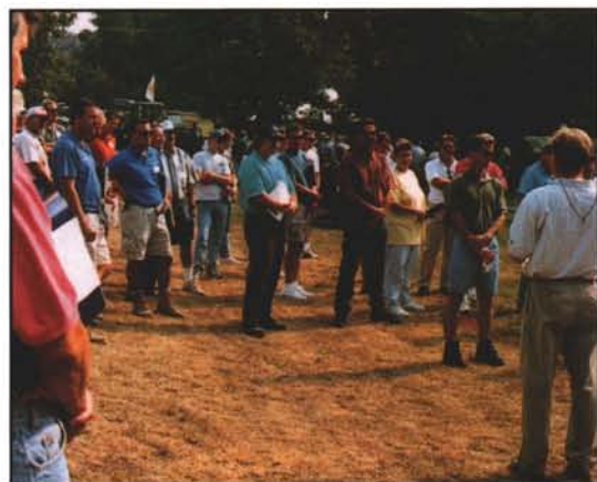
One vendor talking to a group during the field day.