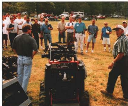
Vendor demonstrations were part of KAFMO Extension field days.