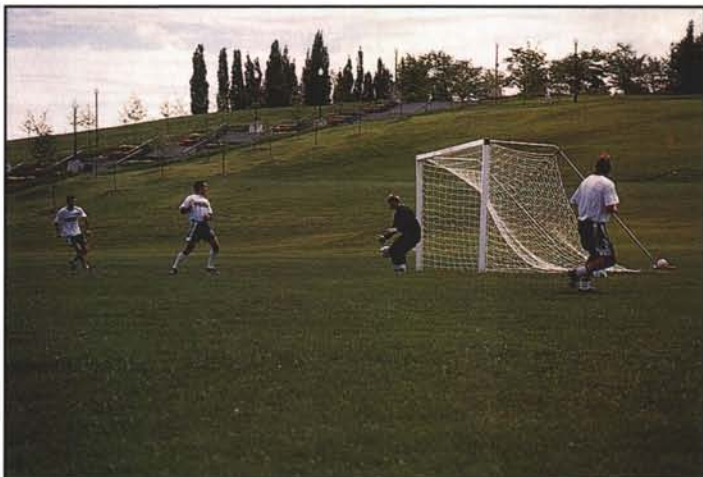
The Soccer Complex at Westminster (CO) City Park, STMA's 1998 Soccer Field of the Year in the Parks and Recreation Category.

1999 also marked the first Chapter Officers Training Session (COTS). The