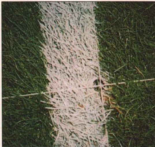
Crossing two string lines allows paint crews to accurately line the field and center the logos.

If the press and the public see that your field looks great, they'll