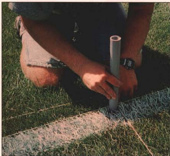
In-ground markers eliminate the need to establish base measuring points each time you paint.

We draw a tape measure across the back of the endzone from sideline to sideline and run a string line. We measure and