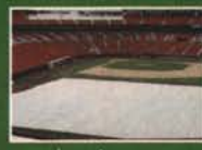
Any size cover

COVERMASTER INC., 100 WESTMORE DR., 11-D, REXDALE, ON, M9V 5C3 TEL 416-745-1811 FAX 416-74-COVER (742-6837)