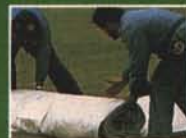
Easy to install