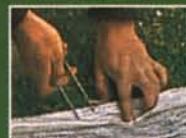
Anchor pegs supplied