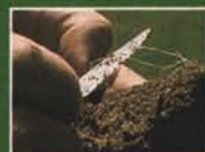
Deeper root development