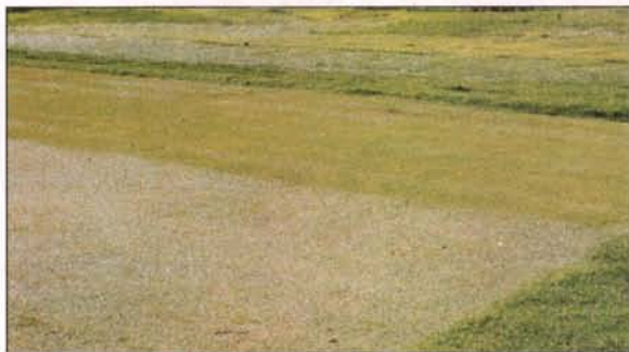
Left Side Untreated, Right Side Treated With BREAK-THRU®