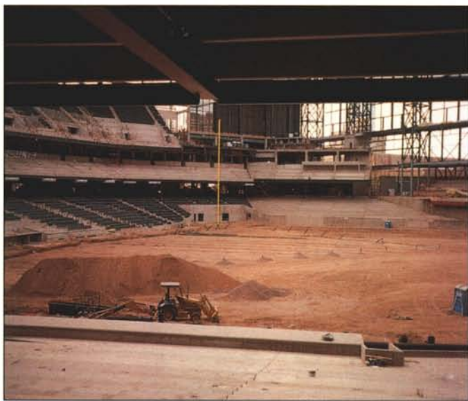
Shown during its construction, BOB is a probable Seminar on Wheels stop for the STMA's 1999 Conference.

Keystone Athletic Field Managers Organization (KAFMO Chapter): On February 19, the KAFMO Chapter