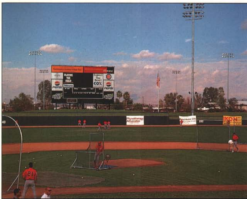
Mesa's Hohokam Stadium hosted the STMA of Arizona Fall 97 Turf Seminar on November 13.