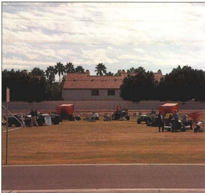
Attendees were able to survey to field as they looked over new equipment on display.

the afternoon and evening following the Seminar to give national board members a preview of some of the probable sites for Seminar on Wheels tours. They were extremely impressive.