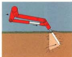
Verti-Drain's patented parallelogram design shatters the soil. Coring tines are also available on all models.