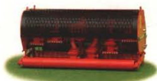
Verti-Drain Greens Model 7316, just one of nearly a dozen models available to fit virtually every budget.

P.O. Box 1349, Kingston, PA 18704 • 1-800-597-5664