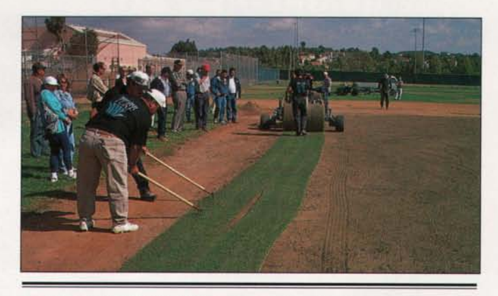
Southern California Chapter members look on as the sodding crew starts laying the infield turf.

Sunny California skies and mild temperatures greeted the 40 participants at 7 a.m. on Friday, October 25, at Rancho Buena Vista High School. Anticipation was high during the meet, mingle and munch registration hour. This two day meeting was to mark another Southern California Chapter tradition — the community service project — and this year's target was the high school's baseball field.