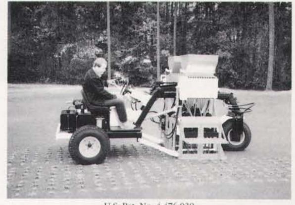
U.S. Pat. No. 4,476,938