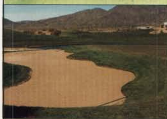
Desert Mountain Golf Course Arizona