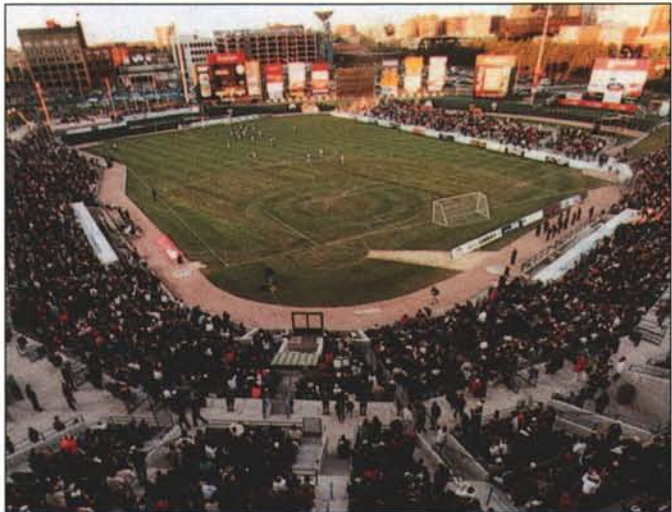
On Memorial Day, Frontier Field in Rochester, N.Y., became the site of the first conversion of a baseball diamond to a professional soccer pitch.