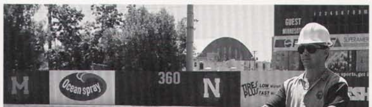
Groom 2-4 acres an hour with National Mower 70" Sports Turf Triplex