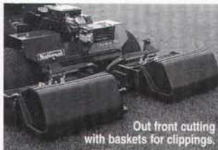
Out front cutting with baskets for clippings.