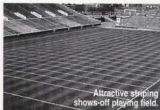
Attractive striping shows-off playing field.